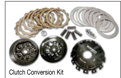
Clutch Conversion Kit