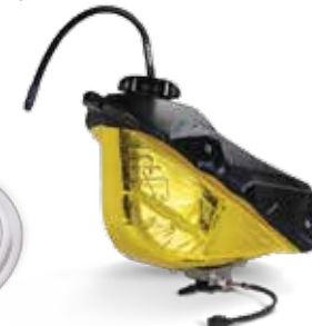
Reflective Film Gold