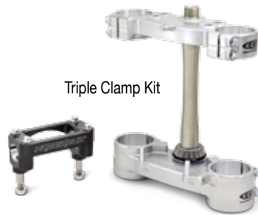
Triple Clamp Kit