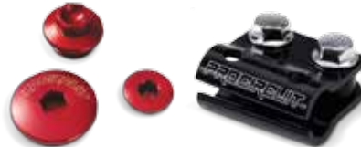
Engine Plug Kit