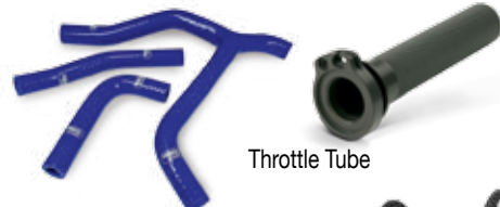
Radiator Hose Kit