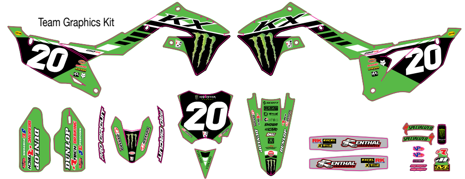
Team Graphics Kit