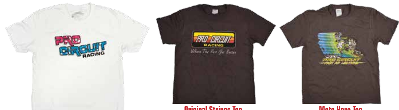
Old School Tee