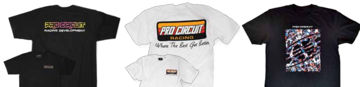
Racing Development Tee

Finally, our Monster Energy/Pro Circuit/Kawasaki line of apparel puts you as close to being a team member as a fan can be. We offer a simple 3-logo team design or a much more decorated full logo design that includes all of our team sponsors. Race team apparel is available in multiple styles including tees, long sleeves, hoodies, hats, and jackets in all the popular sizes.