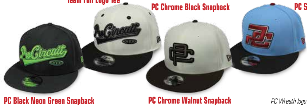
PC Black Neon Green Snapback