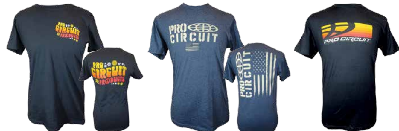
Womens Groovy Tee