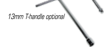
13mm T-handle optional