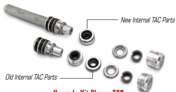
New Internal TAC Parts