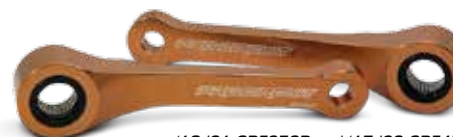
'18-'21 CRF250R and '17-'20 CRF450R Pull Rods

The stock linkage systems for the KTM and Husqvarna models causes the bike to have a feeling that is much too harsh and stagnant, whereas some of the preceding models had an OEM linkage system providing an unwanted lazy and soft feeling. The Pro Circuit linkage system utilizes some of the mechanical advantages of both designs, which allows for the use of a more true-to-weight spring rate and to reach the ultimate sweet spot in handling.