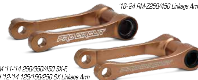
'18-'24 RM-Z250/450 Linkage Arm

The Pro Circuit Linkage System offers a plush feel while increasing traction. A considerable amount of testing for this has resulted in a more true-to-weight spring rate to reach the ultimate sweet spot in handling .