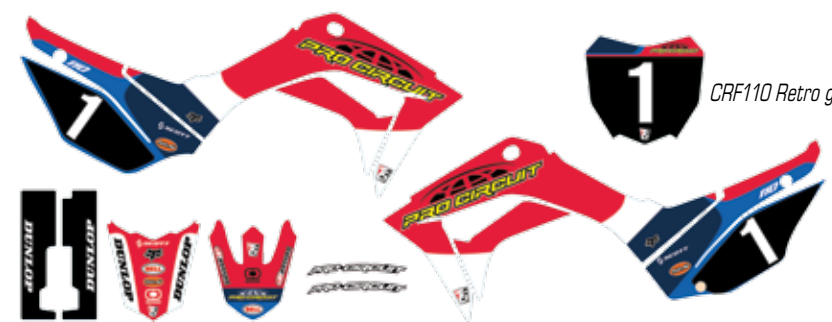
CRF110 Retro graphics shown here

CRF / KLX Our shift lever is designed to prevent dirt from clogging and interfering with shift lever functionality. This shifter is also slightly longer than the OEM shift lever to benefit adults.