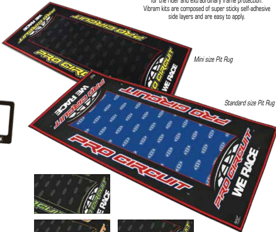
Mini size Pit Rug

Our coffee mugs are perfect for those early mornings at the track.