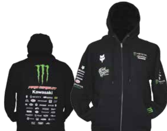
Team Zip Hoodie