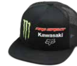
2024 Team Snapback