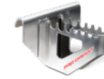
Optional T-handle holder also available.

Banjo Bolts can be fastened onto the front and rear brake master cylinders, and front and rear brake calipers.