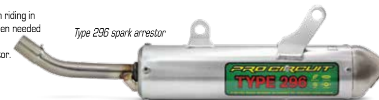
Type 296 spark arrestor

The Type 296 is a quiet spark arrestor that should be used when riding in noise sensitive areas or any National Forest. It is easy to repack when needed and features an aluminum and stainless steel construction for increased durability. Equipped with a U.S.F.S. approved spark arrestor.