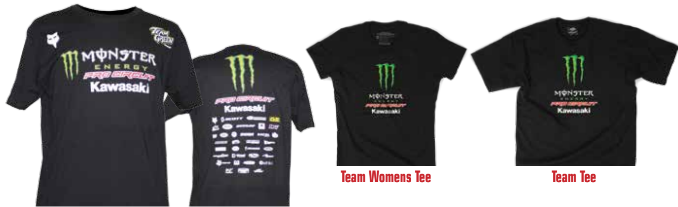
Team Full Logo Tee