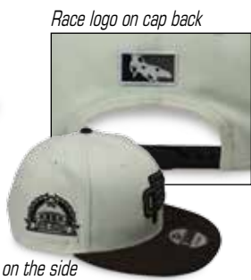
PC Wreath logo on the side