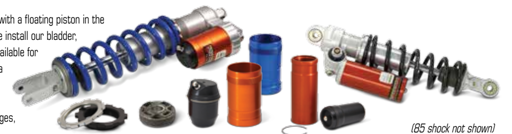
WP 50mm x 18mm Shock 250/350/450

The new large reservoir WP shock comes with a floating piston in the reservoir to separate the nitrogen and oil. We install our bladder, high-volume bladder cap, and reservoir kit (available for KTM models in orange and blue for Husqvarna models) to increase volumes and make the shock a smoother, more seamless stroke. This, along with our personalized valving changes, really bring out the performance in this shock.