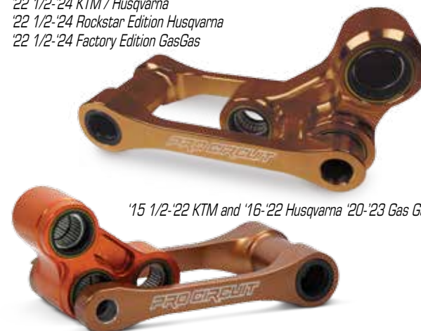
'15 1/2-'22 KTM and '16-'22 Husqvarna '20-'23 Gas Gas

'22 1/2-'24 KTM / Husqvarna '22 1/2-'24 Rockstar Edition Husqvarna '22 1/2-'24 Factory Edition GasGas