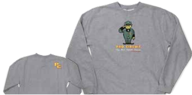
Service Crew Neck