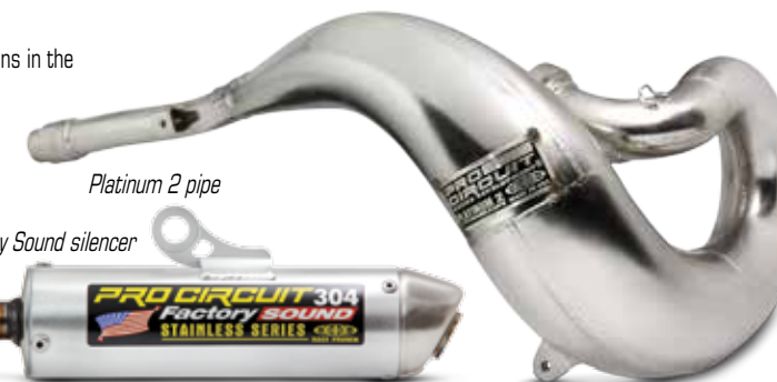
Platinum 2 pipe

The Platinum 2 Pipe offers incredible performance with substantial power gains in the low-to-mid range, but is tuned specifically for people who ride or race off-road. The Platinum 2 is also stamped from AKDQ high-quality carbon steel, consists of hand welded and pounded seams and features reinforced mounting brackets and stinger.