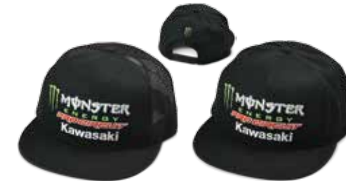
Team Snapback Mesh and Standard