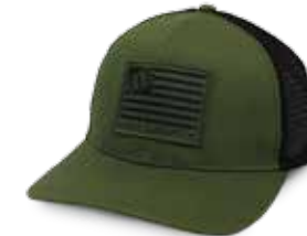
Flag Snapback (olive)