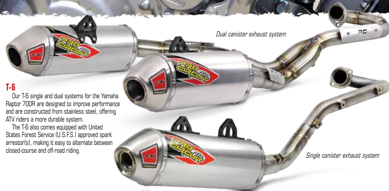
Dual canister exhaust system

Our line of accessories offers a special way to make your motorcycle stand out at the race track. A little bit of style and performance is what it's all about when personalizing your machine, why not do it the right way? Every accessory we make enhances either the way your bike runs, handles, and/or looks. From our Billet ignition covers to our Carbon Fiber Chain Guides, every Pro Circuit accessory offers more than what an OEM part can provide. We're proud to create top quality parts and accessories with the Pro Circuit name attached to every single item out there.