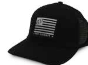
Flag Snapback (black)