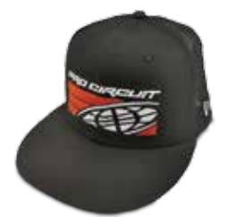
PC Globe Snapback