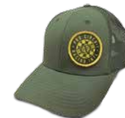
Checkered Globe Snapback