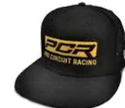
PC Racing Snapback