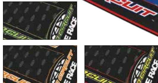
Standard size Pit Rug